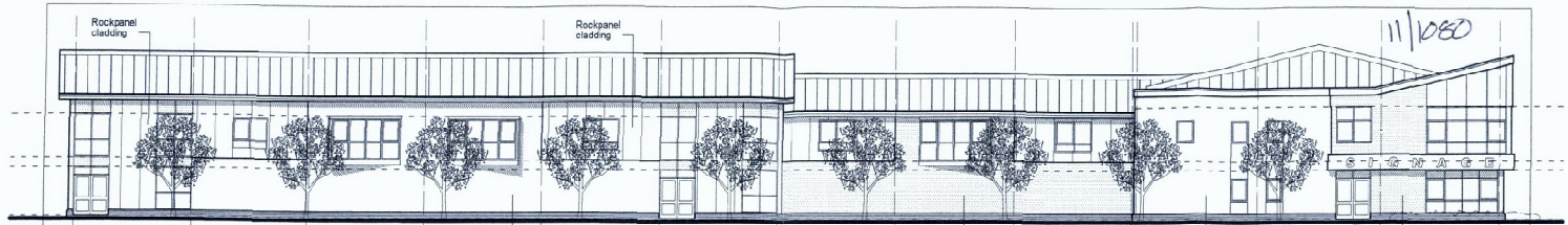
East elevation as proposed Scale 1:200